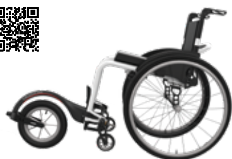
ICON 60 with TRACK WHEEL