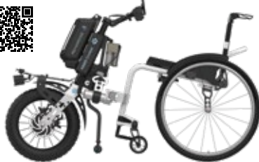
ICON 60 with PAWS